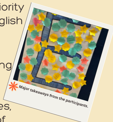
Major takeaways from the participants.