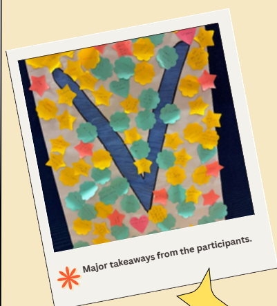
Major takeaways from the participants.