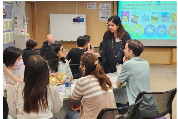
Using stories as an SEL tool