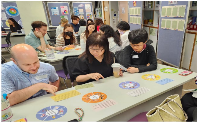
Understanding the 5 core competencies of SEL