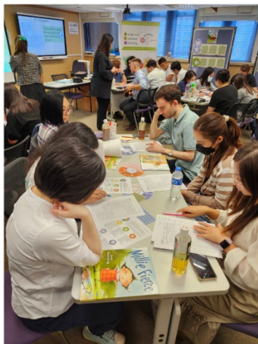
Identifying story elements and reading skills for the teaching of SEL through stories