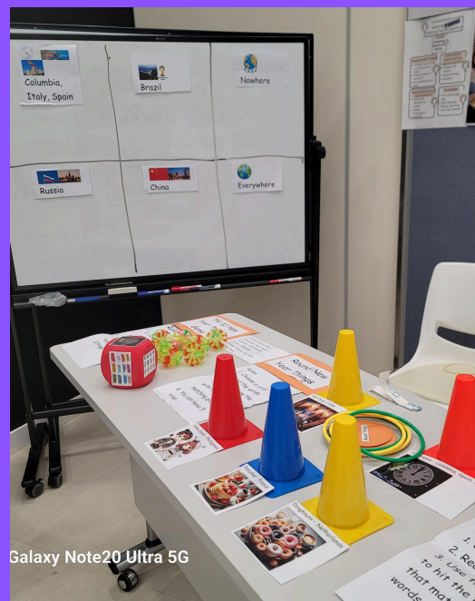
Galaxy Note20 Ultra 5G